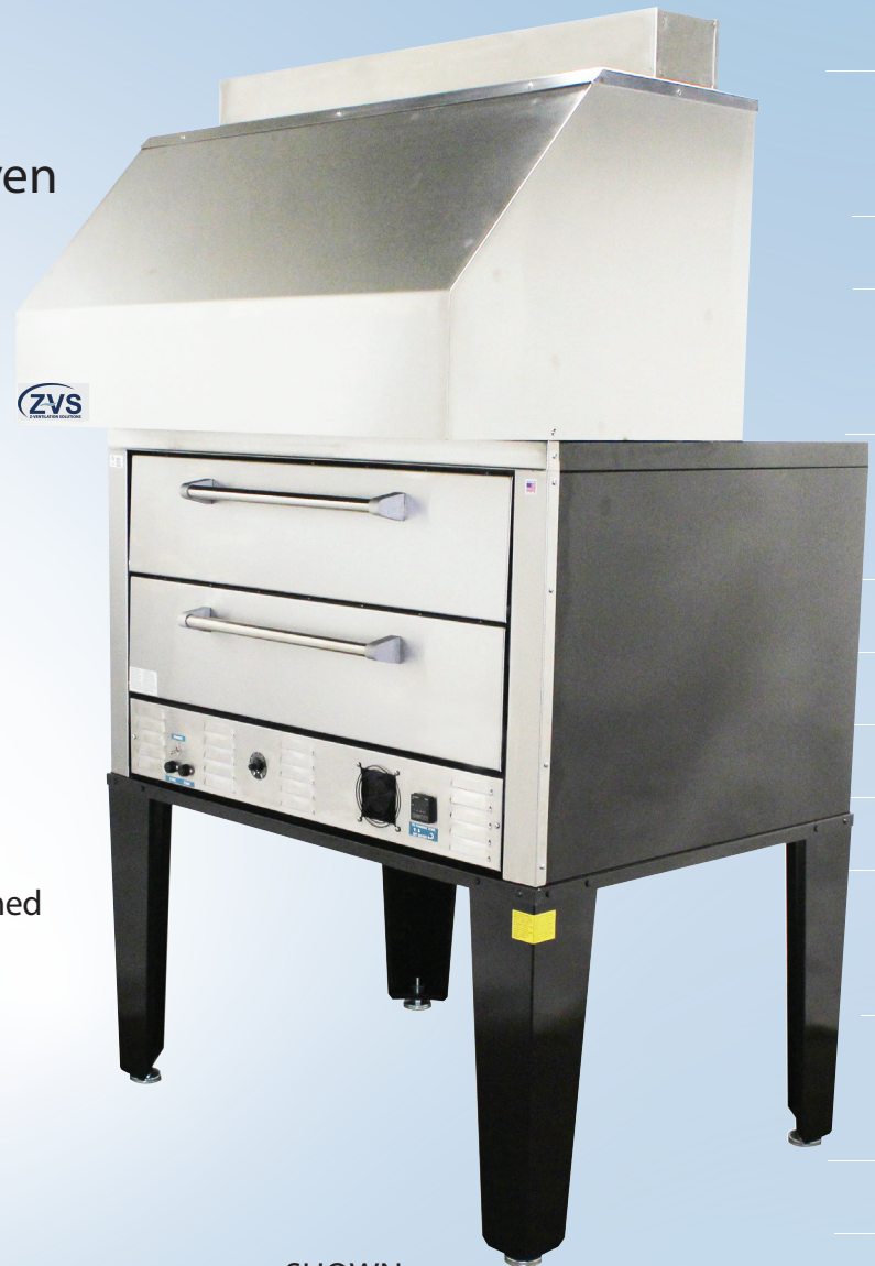
SHOWN ZVH-50 Ventless Hood with Oven